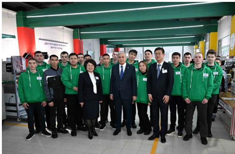
Figure 2. Meeting in “Lu Ban Workshop” training center

On February 26, 2024, President Kassym-Jomart Tokayev visited D. Serikbayev East Kazakhstan Technical University, where he saw all activities of the university and the “Lu Ban Workshop” training center (Figure 2). The project provides for further strengthening of cooperation between Kazakhstan and China in the field of applied technologies and higher technical education, as well as support for the “One Belt, One Road” initiative.