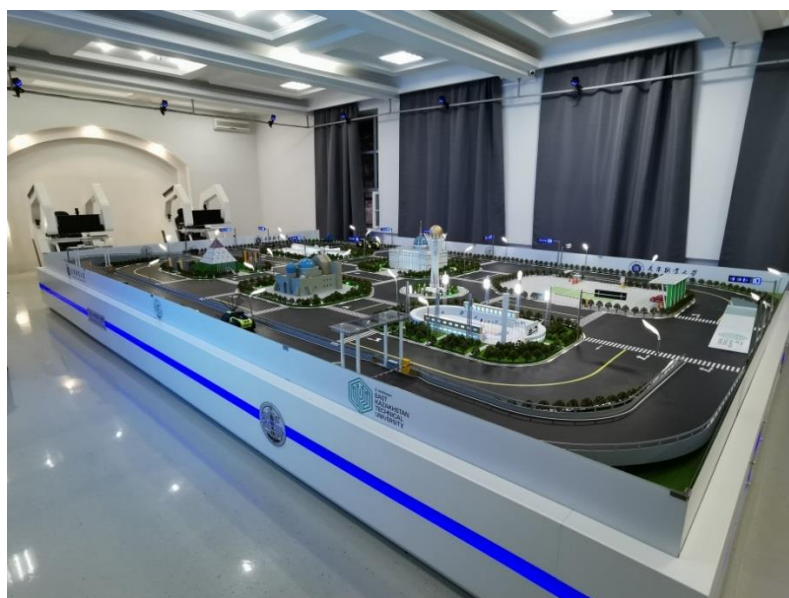
Figure 4. Smart room in “Lu Ban Workshop” training center

The uniqueness of the Center lies in the possibility for trainees to obtain practical skills and conduct simulation tests of automotive systems. Special attention is paid to learning the latest technologies for maintenance and diagnostics of electric and hybrid vehicles.