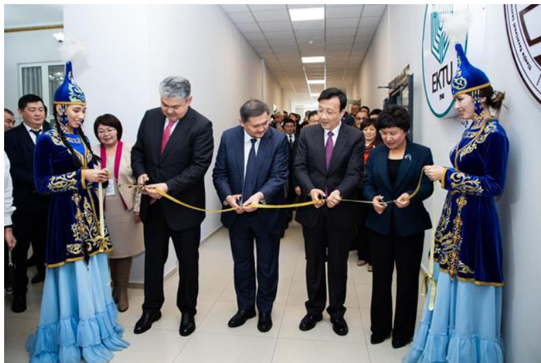
Figure 1. The opening ceremony

unified human destiny. “Workshop Lu Ban” is an international education cooperation project to realize the internationalization, branding and systematization of Chinese vocational education. The project is built on the principles of equal cooperation, prioritizing quality, focusing on competence and skill development, integrating industry and education, and adapting to local conditions. The project involves physical institutions outside China to provide academic education and technical training.